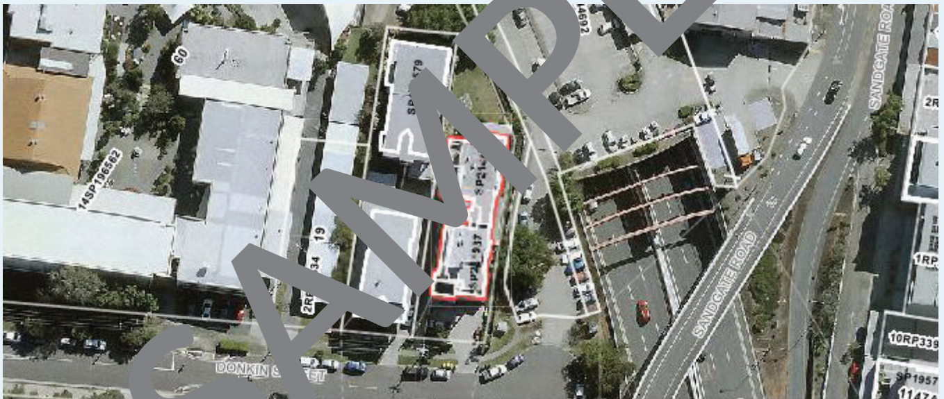
Department of Regional and Brisbane City Council | Brisbane City Council | © Brisbane City Council... Powered by Esri